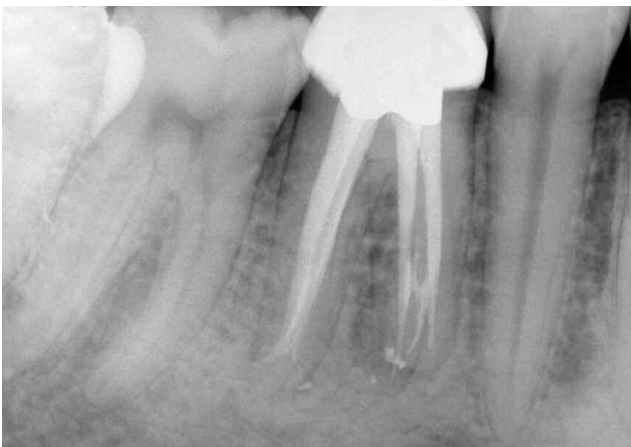
Figure 2. Post-op film of a mandibular first molar depicting a three-dimensionally packed root canal system. Note the anastomosing system in the mesial root and the multiple apical portals of exit. As is very often the case, the distal root contains two canal systems.