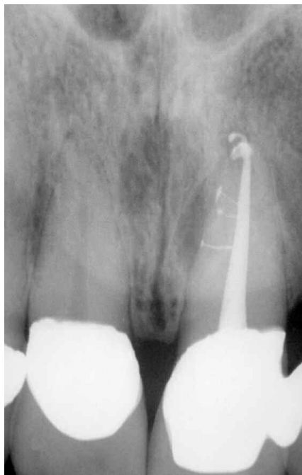
Figure 10b. Post-op film after three-dimensional cleaning, shaping and obturation. Note the three treated lateral canals.