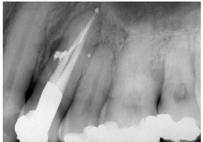
Figure 1b. Three-year recall demonstrates excellent apical and lateral ossification. Note the shape and apical flow of the merging buccal and lingual systems containing several lateral canals and that surplus material has not impeded healing.

Historically, our eagerness to look for only apical endodontic lesions is attributable to the conception of pulpal disease flow occurring within roots containing simple, uncomplicated canals exhibiting generally one apical portal of exit. This oversimplified anatomical model must not be perceived as correct ( Figure 2 ).