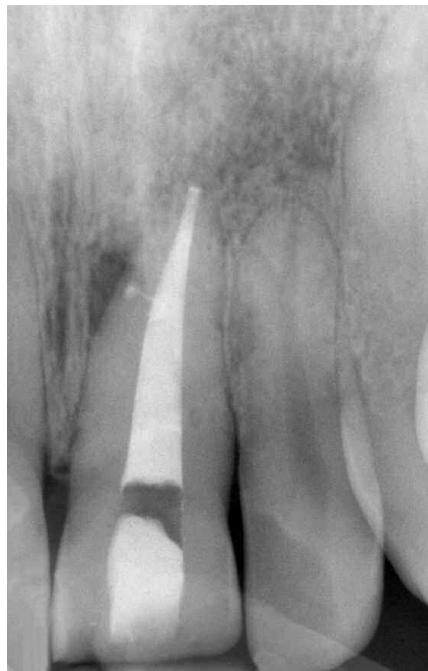
Figure 5b. Post-op film demonstrates dense three-dimensional obturation with the Schilder Warm Gutta Percha technique. Note treated lateral canal implicated in pre-op pathology.