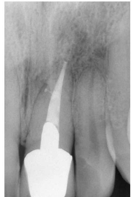
Figure 5c. Three-year review demonstrating the inevitable osseous repair following complete treatment.