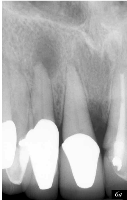
Figure 6a. Pre-op film of a maxillary central and lateral incisor. A revelation in endodontic diagnosis occurs when the clinician observes not only the apical lesion of the lateral incisor, but also the midline crestal lesion of the central incisor. Both teeth tested pulpless with intact sulcuses.