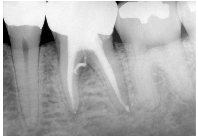
Figure 7b. Post-op film demonstrates the periodontal importance of treating lesions of endodontic origin with appropriate therapy. The pulpal floor was packed with gutta percha/sealer, establishing a furcal environment conducive to tissue re-attachment and pocket elimination.