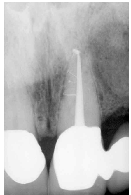
Figure 10c. Five-year review demonstrates the importance of three-dimensional endodontic treatment and excellent progressive healing.