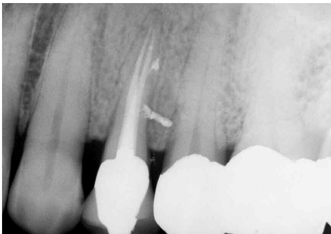
Figure 3c. Six-month review demonstrates good progressive apical and lateral bone fill.