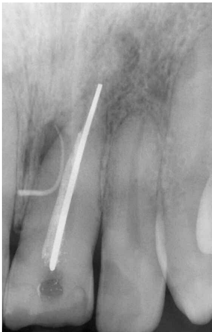
Figure 5a. Pre-op film of a maxillary central incisor previously treated endodontically with a combination gutta percha/silver point obturation technique. The traced fistulous tract points to a large lateral root lesion.