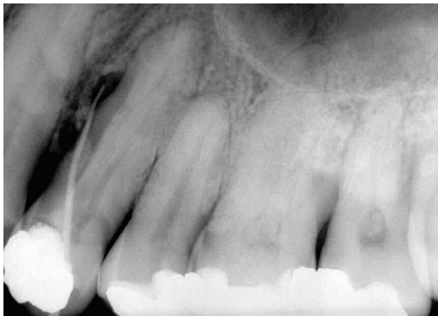
Figure 1a. Pre-op film of a maxillary first bicuspid. Note the large lateral root lesion and the presence of a traced fistula. Pulp testing confirms a lesion of endodontic origin.

Dental radiographic examination frequently depicts radiolucencies approximating root surfaces ( Figure 1 ). Apical radiolucencies in particular tend to cast suspicion on pulpal health and are often associated with endodontically involved teeth. Certainly, thorough pulp testing schemes should be conducted to corroborate this radiographic suspicion, allowing the clinician to differentially diagnose the presence or absence of a lesion of endodontic origin .