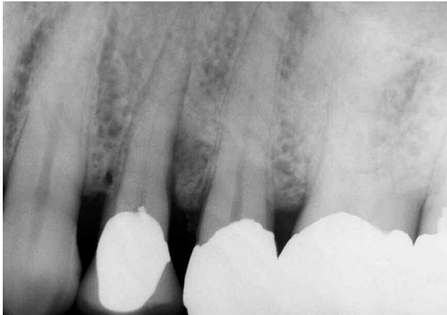
Figure 3a. Pre-op film of a maxillary first bicuspid demonstrating a significant distal crestal lesion threatening the sulcus.

Regardless of terminology, these various configurations commonly communicate with the attachment apparatus periradicularly. Consequently, any opening from the root canal system to the periodontal ligament space should be thought of as a portal of exit that potential endodontic breakdown products may pass through.