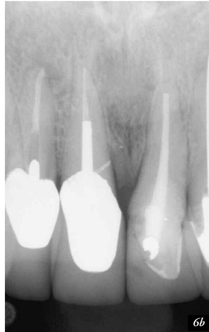
Figure 6b. Six-month review demonstrating excellent progressive healing. As expected, three-dimensional cleaning, shaping and obturation of the root canal system allows for both apical and crestal ossification. (Note the failure to utilize the entire post-space).