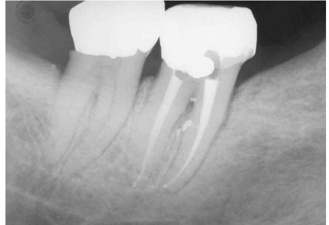
Figure 9b. Post-op film with bridge removed and tooth banded to facilitate root canal therapy and prevent fracture. Note two treated lateral canals positioned furcally. Re-attachment was noted one week after cleaning and shaping.