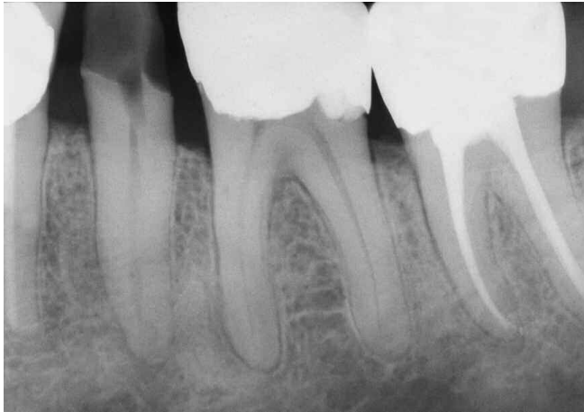
Figure 4a. Pre-op film of mandibular second bicuspid opened previously on an emergency basis to afford drainage. Note that the primary canal is hard to interpret apically but the position of the lesions gives insight into apical canal morphology.

Most lateral root and furcal portals of exit are not visible radiographically. However, well-angulated radiographs will frequently depict lesions of endodontic origin not only apically ( Figure 4 ), but laterally ( Figure 5 ), coronally ( Figure 6 ), and in the bi- and tri-furcations of multi-rooted teeth ( Figures 7 and 8 ). Many periodontal sulcular defects may be attributable to significant lateral canals disseminating irritants. The endodontic/periodontic differential diagnosis and proper sequence of treatment are paramount in resolving periodontal lesions of endodontic origin ( Figure 9 ).