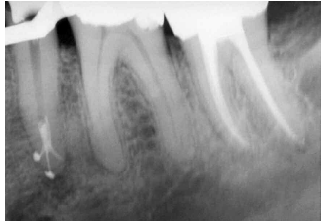
Figure 4b. Post-op film reveals "the pack" and depicts completed treatment of the primary system containing three apical portals of exit.