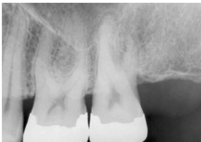
Figure 8a. Pre-op film of a maxillary second molar depicting a lesion of endodontic origin furcally and apically associated with the distal-buccal root.