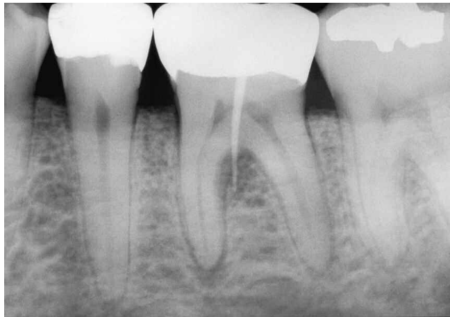
Figure 7a. Pre-op film of mandibular first molar exhibiting a lesion of endodontic origin apically and furcally. An intersulcular fistula is traced with a gutta percha point.