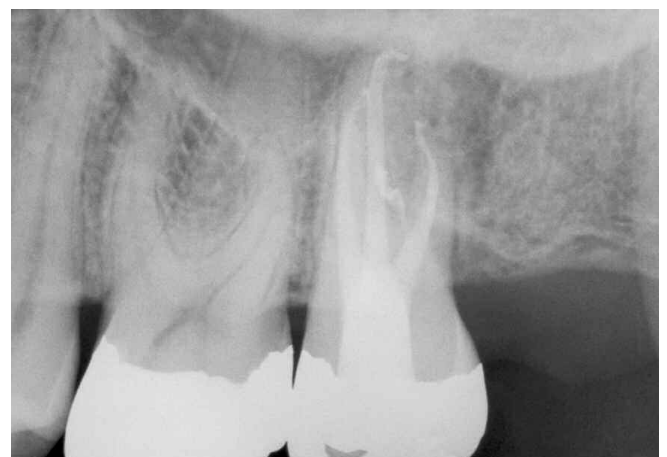
Figure 8b. Post-op film demonstrates the shape and flow of the packed root canal system. Note treated furcal canal and apical recurvature of the distal-buccal system.