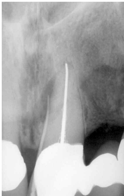
Figure 10a. Pre-op film depicting a maxillary central incisor bridge abutment. A gutta percha point traces a fistulous tract to a large lateral root lesion. The canal is considerably under-filled and slightly overextended.