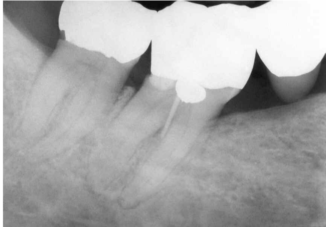
Figure 9a. Pre-op film depicting posterior bridge abutment with a history of recurrent submarginal distal decay/temporization. Buccal intersulcular pocketing and drainage was verified with a gutta percha point tracing into furcal lesion.

Clearly, the predictable resolution of endodontic lesions will be dependent on many treatment variables, including diagnosis, complete access to the root canal system, skill, diligence, determination, and anatomical familiarity in utilizing treatment techniques carefully directed towards three-dimensional cleaning, shaping and obturation of the root canal system. ▲