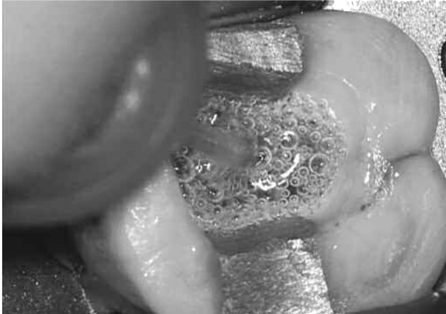
Figure 3a. This clinical image shows the EndoActivator System in use. Note the powerful activation of fluid and appreciate the potential for enhanced 3-D cleaning.