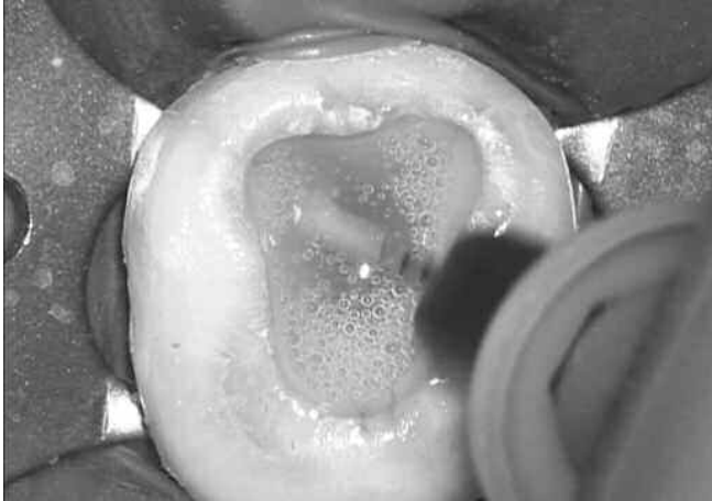
Figure 5. In the retreatment situation, the vibrating EndoActivator tip may be used with a solvent to move residual obturation materials into solution.

and compromise retreatment disinfection and success. Fortunately, the EndoActivator's single-use polymer tips may be activated and used within a solvent-filled pulp chamber to enhance the removal of residual obturation materials. Placing a vibrating polymer tip into a solvent-filled canal will encourage the disruption and removal of residual obturation materials, which in turn will promote the more effective exchange of irrigant. Clinically, this phenomenon is readily appreciated by observing remnants of obturation materials moving into solution and the subsequent discoloration of the clear solvent fluid within the pulp chamber ( Figure 5 ).