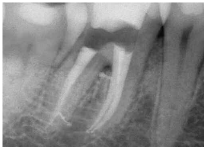
Figure 2. This post-treatment film demonstrates the result of shaping canals, cleaning root canal systems utilizing fluid activation, and three-dimensional obturation.

The EndoActivator System provides a safe, easy, and affordable method designed to clean a root canal system. In clinical use, the efficacy of the EndoActivator is immediately appreciated. During use, the action of the vibrating tip frequently produces a “cloud” of debris that can be clinically observed in a fluid-filled pulp chamber. This hydrodynamic activation serves to improve the penetration, circulation, and flow of irrigant into the more inaccessible regions of the root canal system ( Figure 3 ). Cleaning root canal systems is the opening for three-dimensionally filling and long-term success.