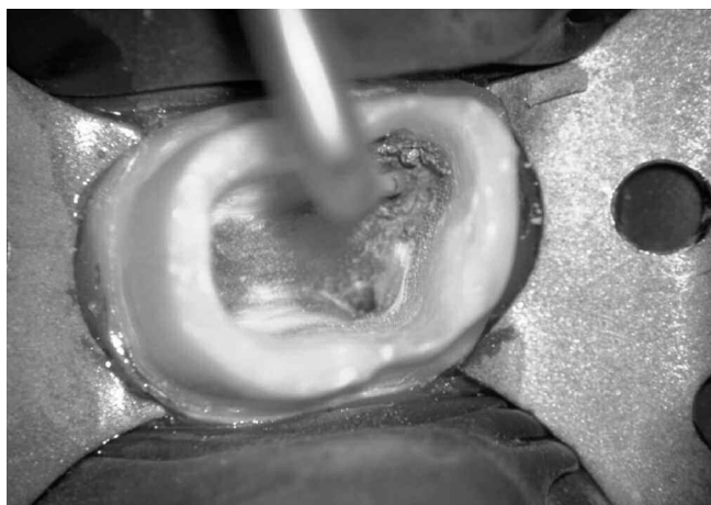
Figure 5. A photograph demonstrates an ultrasonic ProUltra Endo Tip vibrating MTA into the MB canal and related perforation.

Despite all the promises in the future for greater clinical satisfaction, clinicians must still work on the fundamentals that provide success. The one thing that has never changed in the history of mankind is root canal systems and their infinite range of anatomical variability. The one thing to remember is that proven concepts tend to endure whereas instruments and techniques come and go. There is an old expression for wise clinicians to consider: "Give a man a fish and he will eat for a day...Teach a man to fish and he will eat for a lifetime". ▲