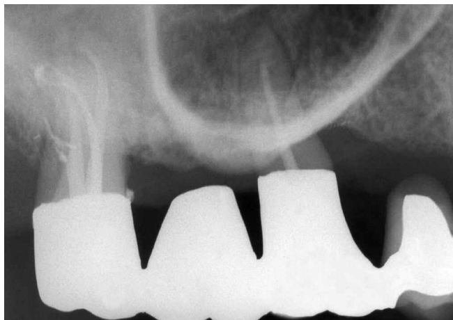
Figure 1a. A pre-operative film shows multidisciplinary treatment. The maxillary left first molar's remaining palatal root is endodontically failing.

Clearly, many previously treated endodontic cases currently need retreatment, many more teeth have already been non-surgically retreated, others have been surgerized, and a large number of failures have been extracted. Failures are neither good nor bad ...they just are. Mao Tse Tung wrote that the foundation of success is failure, with the important caveat, IF we accurately discern the cause of failure. The challenge is for dentists to fully embrace proven concepts, become more proficient, and take advantage of the significant procedural refinements which have occurred during the last decade so we can fulfill the public's higher expectations for predictable results. When the best of what endodontics has to offer is intelligently integrated, then the naturally retained root will be recognized as the ultimate dental implant ( Figure 1 ).