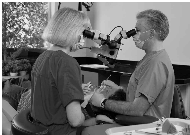
Figure 2. All phases of endodontic treatment are significantly improved when the dental team utilizes the microscope.

The evolution of ultrasonic technology occurred with the advent of the microscope. As an example, ultrasonic instruments had long been available but were not optimally designed. This problem created possibility for a solution. I began working with a high quality machine shop, and in 1996, we invented three unique ultrasonic features which were patented, and significantly improved clinical outcomes. First, we made all the nonsurgical line of ultrasonic instruments contra-angled to improve procedural access into the roots of all teeth. Second, we made the distal working portion of the instruments with parallel-sided walls to improve access and vision. Third, our instruments were made abrasive to improve sanding and cutting efficiency. These three manufacturing features had never been utilized on any nonsurgical ultrasonic instrument distributed in the world. Dentsply Tulsa Dental distributes these ultrasonic instru-