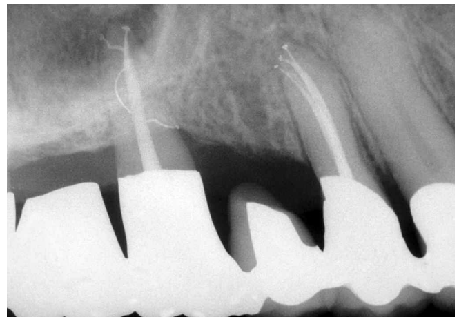
Figure 1b. Three-dimensional endodontic retreatment is the foundation of perio-prosthetics.