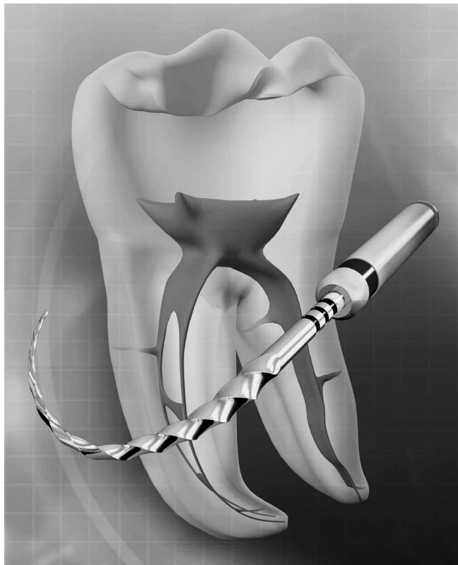
Figure 4. A graphic animation demonstrates the remarkable flexibility of a NiTi ProTaper rotary shaping file.

Dr. Ruddle: There are several new lines of files that have recently become available, all of which are quite different in design and performance. Over several years, as we have used NiTi files, taught rotary preparations, and invited clinical feedback, we have learned that dentists are looking for four features. The features are improved efficiency, better flexibility, greater safety, and importantly, simplicity. Surveys from the international opinion leaders have rated the ProTaper files as coming closest to fulfilling these desirable and sought after features. Synergistically, more creative and sophisticated instrument designs, in conjunction with advanced machining techniques, have taken NiTi rotary files to the next level and have dramatically benefited clinical performance ( Figure 4 ). Even with all the current improvements in file design and machining, the profession will continue to develop new, more innovative instruments as we pursue the endless journey towards a more perfect file.