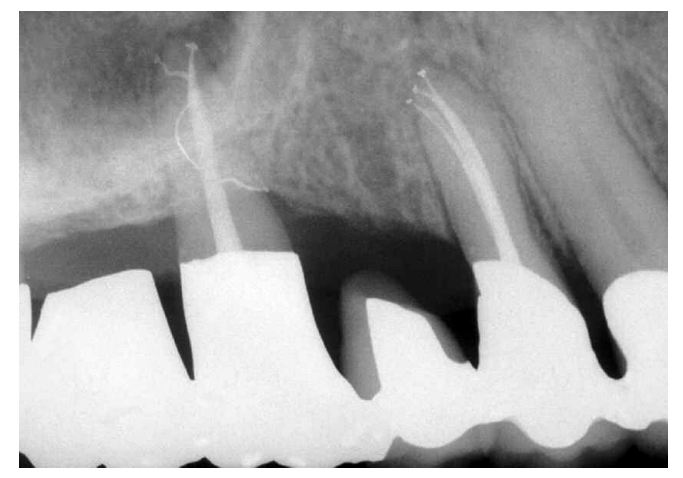
Figure 1b. Three-dimensional endodontic retreatment is the foundation of perio-prosthetics.