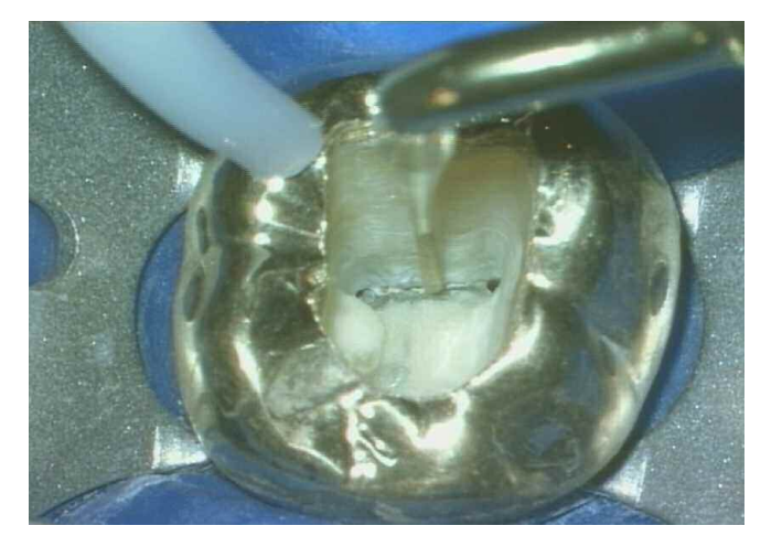
Figure 3. A photograph demonstrates an ultrasonic ProUltra Endo Tip precisely troughing along the groove between the MB and ML orifices.