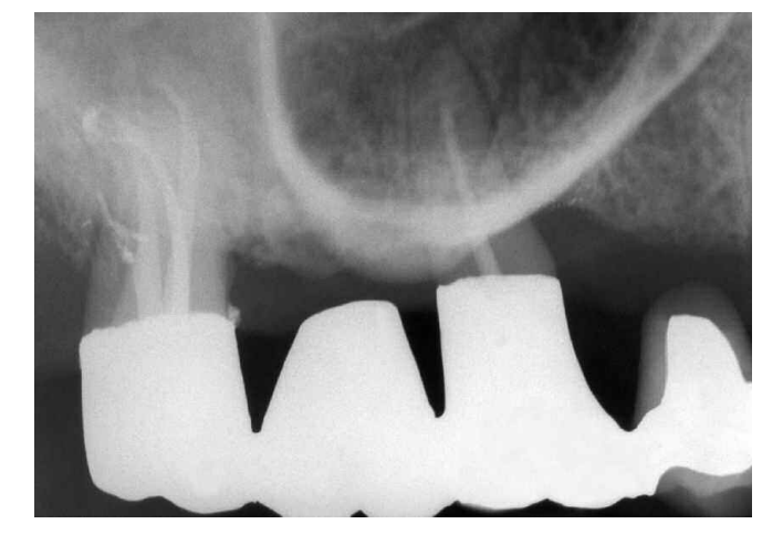
Figure 1a. A pre-operative film shows multidisciplinary treatment. The maxillary left first molar's remaining palatal root is endodontically failing.

Clearly, many previously treated endodontic cases currently need retreatment, many more teeth have already been nonsurgically retreated, others have been surgerized, and a large number of failures have been extracted. Failures are neither good nor bad ...they just are. Mao Tse Tung wrote that the foundation of success is failure, with the important caveat, IF we accurately discern the cause of failure. The challenge is for dentists to fully embrace proven concepts, become more proficient, and take advantage of the significant procedural refinements which have occurred during the last decade so we can fulfill the public's higher expectations for predictable results. When the best of what endodontics has to offer is intelligently integrated, then the naturally retained root will be recognized as the ultimate dental implant ( Figure 1 ).